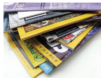
One of many benefits for NEA members.

Please take the time to go online to www.mnea.org to register your MNEA Membership card. This card allows you access to many benefits and savings, including saving 15-18% on most cell phone plans, 5% off at Target.com and many restaurant and travel deals.