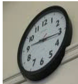
2009-2010 Master Agreement protects teacher plan time.

nized that teacher plan time is necessary for effective teaching. Members who run into a violation of this portion of the agreement, should speak to a building administrator prior to the second lost plan time of the week.